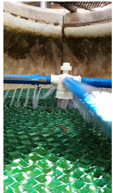
Figure 4 – Inside of Cooling Tower

enough for roof top installation. The system can be installed in existing or new installations as it works as a side stream application (Fig. 4) and doesn't require the removal of any existing piping. An analysis of the water and atmospheric conditions is required to properly size the system.