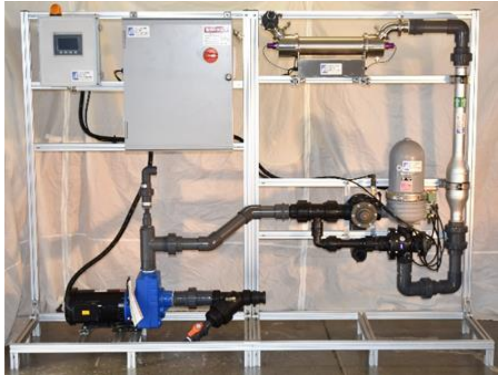
Figure 1 – Industrial Water Innovation's Cooling Tower Skid, 2 x 8 ft.

Therefore, a cooling system limiting the use of chemicals would provide the greatest benefit.