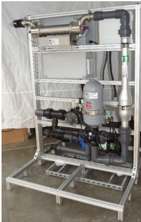
Figure 2 – Industrial Water Innovation's Cooling Tower Skid, 4x4 ft.

A more recent concern with cooling towers is the potential for spreading the legionella spores. The CDC had 6,100 reported cases in 2016, and they feel that the number is significantly under reported, by as much as 50%. The CDC also sponsored a study of cooling towers across the country and found that 84% contained the legionella bacteria. While the spores can enter the system via the atmosphere, it is generally recognized that the major source of the bacteria is the makeup water. The legionella bacteria are harmless if ingested but can lead to legionellosis if inhaled. And cooling towers aerosolize the water containing the bacteria. An additional concern with cooling towers is that legionella can also reside in the biofilm, then becoming a concern when sections sluff off and become part of the circulating water.